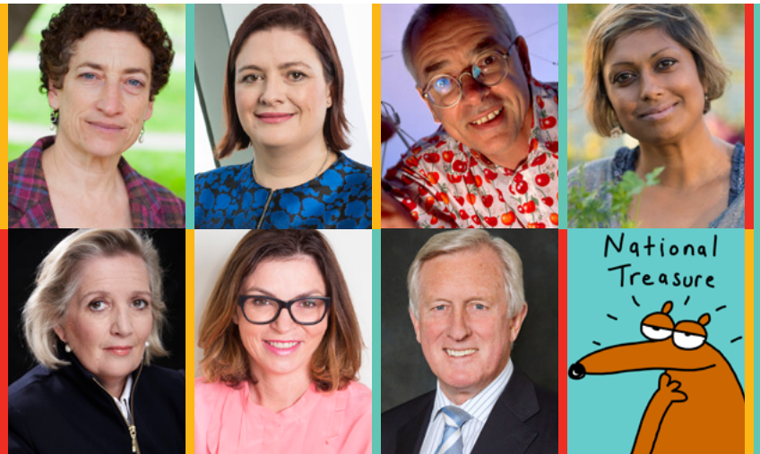
top: David Suzuki