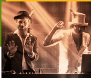
MORTISVILLE VS THE CHIEF